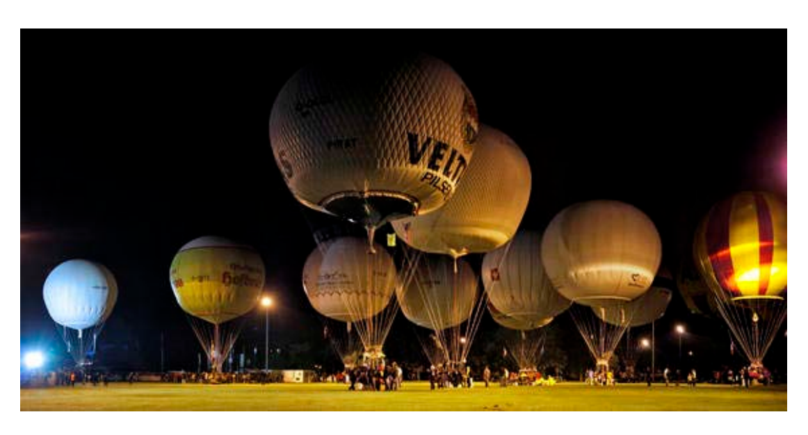
53<sup>rd</sup> Coupe Aéronautique Gordon Bennett, Geneva, Switzerland