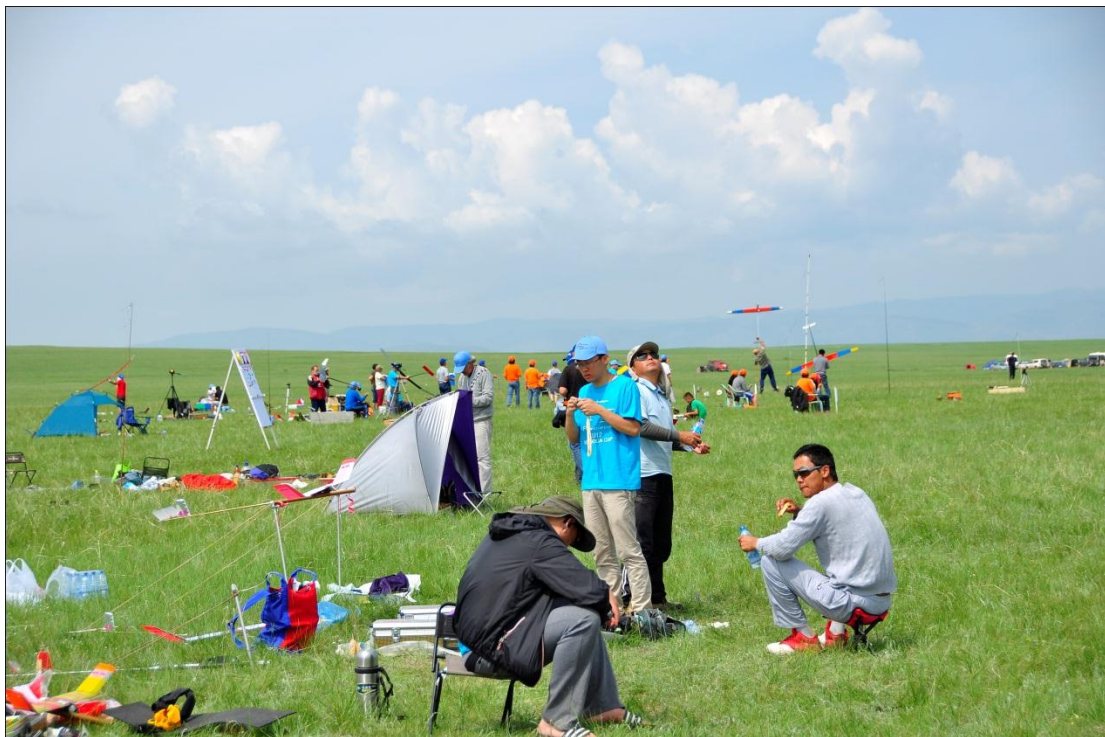
Flying Site – the Field of “Darkhan Noyonii Khudag” (47°71’43.80” N, 107°42’47.74” E)

The average height above sea level (altitude) of the flying field is about 1,350 meters.