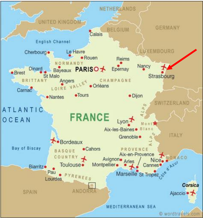
Strasbourg tramway map