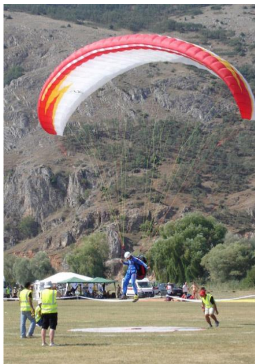
Aerobatic photos – Villeneuve World Championship Accuracy photos – Cali World Games and Malaysia Asian Championship